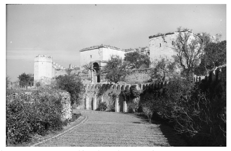
Figure 6. Golden Gate (Porta Aurea) viewed from the southwest; state from 1939. Market garden in the moat near Yedikule and the Golden Gate.

In the years 1969–1970, Tower 70, known as Ulubatlı Hasan Tower, was also restored and partially reconstructed for the 500th anniversary of the conquest of Constantinople [12]. The restorations undertaken in this period had been executed without any proper restoration projects or scientific research and the results of these works were unfortunately never published. The walls were partially over-restored and reconstructed, however, with populist overtones. In the Edirnekapi region, in particular, the ruinous interference with the character of the monument was much criticized at the time. Unfortunately, the restorations in the 1950s were not documented or published, and mistakes were naturally inevitable with such an unprofessional approach, which had nothing to do with modern restoration theories [9]. In 1985, the historic monuments and districts of the city were designated as World Heritage Sites by the United Nations Educational, Scientific and Cultural Organization (UNESCO) [6] and as a consequence