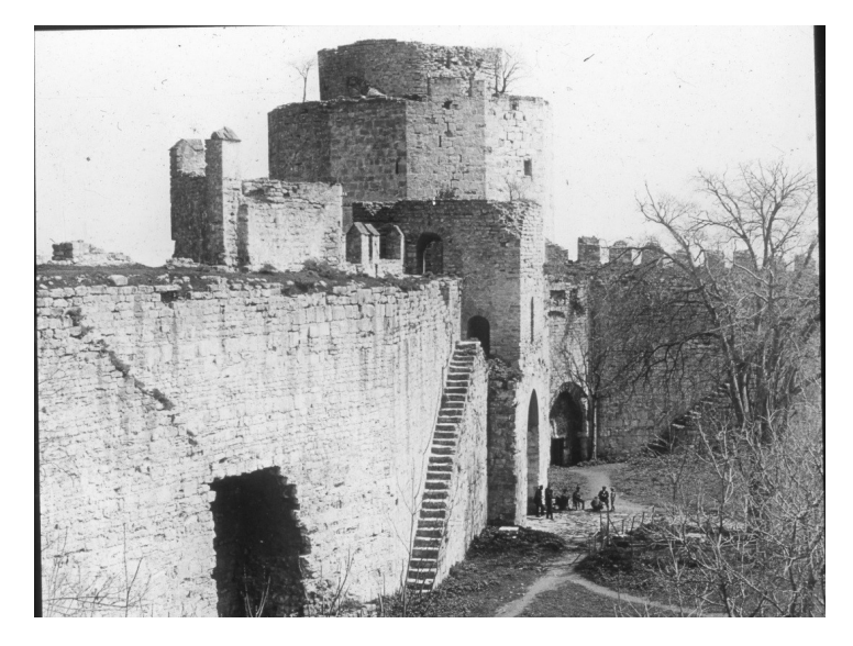
Figure 5. The interior view with Kitabeler kulesi and the entrance to Yedikule.