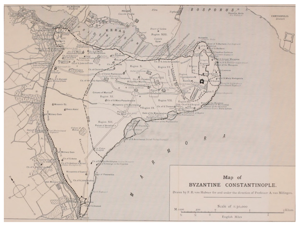
Figure 1. Map of Byzantine Constantinople with the Theodosian Walls (on the left).

Thanks to these walls, Constantinople was conquered only three times: in 1204, by the Fourth Crusade, virtually ending the heyday of the empire; for the second time, by the Byzantines in 1261, during what was, in retrospect, a time when the city was practically undefended; and, finally, by the Ottoman Turks in 1453 [2]. The conquest of the city by the crusaders and its reconquest by the Byzantines revealed the weakness of the sea walls. In turn, the final conquest of Constantinople was accomplished by breaking the land walls' weakest point, located in the central part of the land defense system, in the valley of the river Lycus.