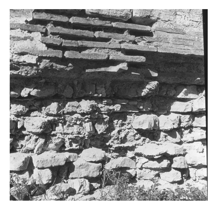
Figure 3. Detail of masonry and brickwork.